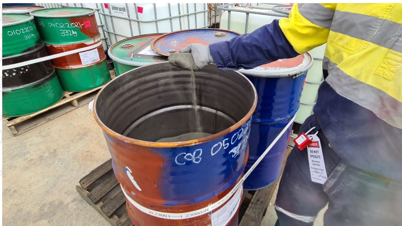
Figure 5 – Calcine received at Broken Hill

Product Recovery – the Pilot Plant recovery circuits will be operated in conjunction with the leach circuit. Existing Mixed-Hydroxide Precipitate (MHP) from laboratory testwork at ALS Perth is being used to commission the cobalt sulphate refinery.