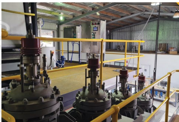
Figure 6 – Leach circuit – trials to begin shortly