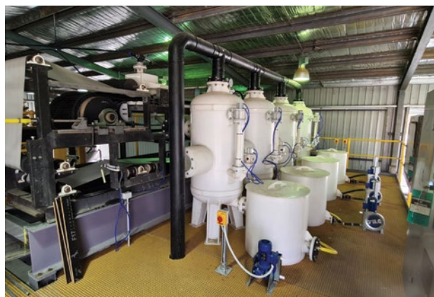
Figure 7 – Product recovery circuit – trials to begin shortly